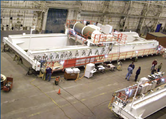
ASSEMBLY OF SATELLITE CRANE IN OUR SHOP